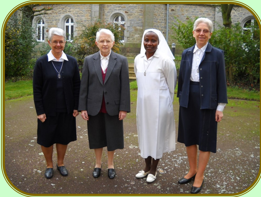
The newly elected Generalate Team, from left to right: