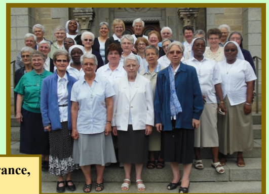
Chapter participants from Quebec, France, Cameroon, and the United States.